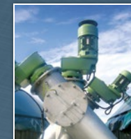
Feeding systems – biogas