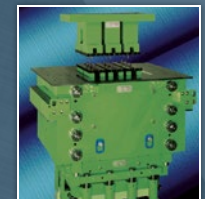
Plates for moulds