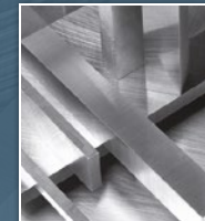
PRECIZ – precision-ground steel